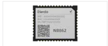
NB-IoT / Cellular Modules Lierda

Monitoring & IoT Connectivity Shielding / SMT Shield-clip