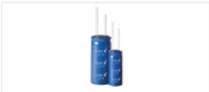
Cylindrical Supercaps Cap-XX