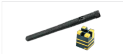
Antennas - MMi Harwin