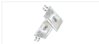
Thin Prismatic, Prismatic Supercaps Cap-XX