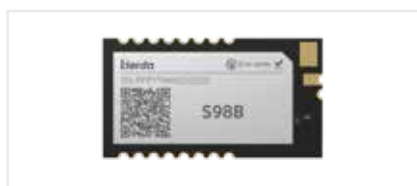
Edge Modules (BLE/Wi-Fi, NearLink) Lierda