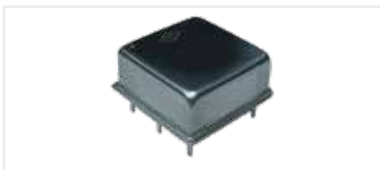
TCXO / OCXO Taitien