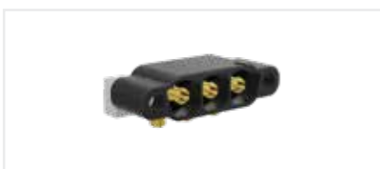
Kona - HRi Harwin